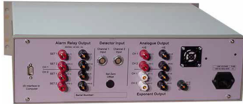
Back view of controller

To help compensate for any background drift in the detectors, the controller has a simple one touch auto-zeroing function. This will zero the entire system across all the measurement ranges.